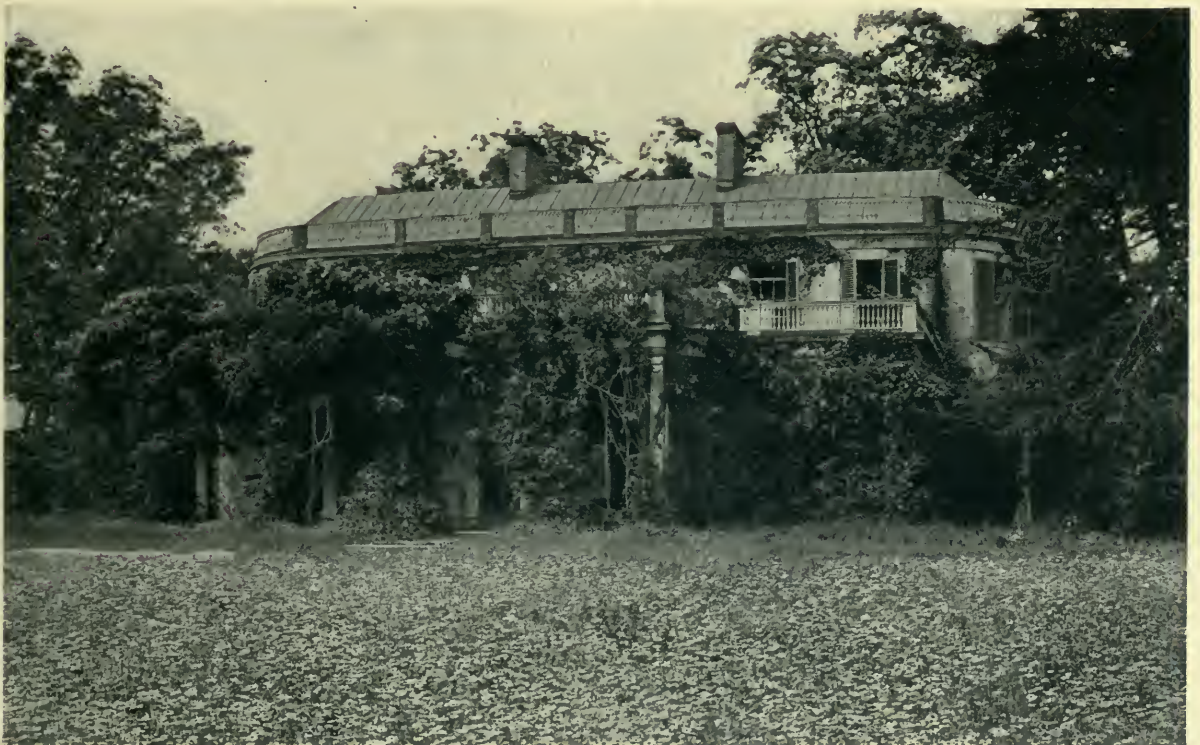
"MONTEBELLO," NEAR BALTIMORE, MARYLAND. Built in 1812

The detail, both exterior and interior, was extremely minute in scale and departed far from classic traditions. This house resembles "Homewood" both in scale and character of moldings